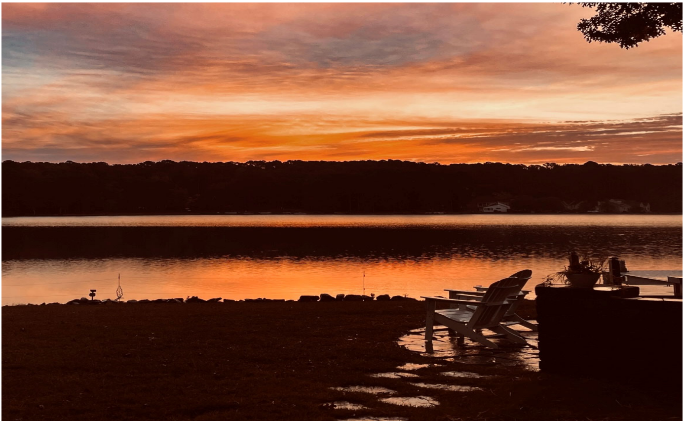
Carolina Trace sunrise.

CTA's Year End 2023 Financial Reports: 2023 Balance Sheet appears on page six.